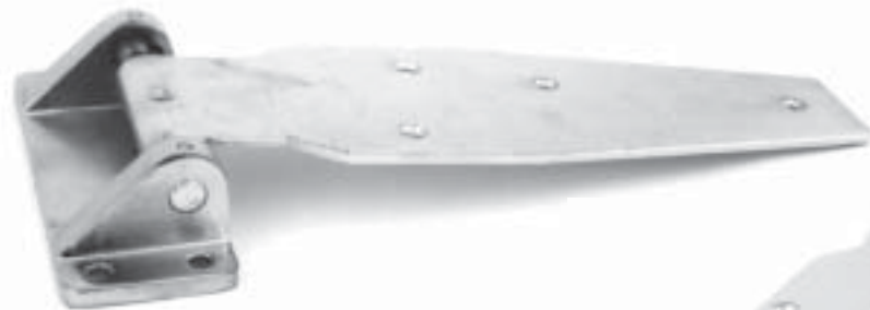
1277 cam-rise strap hinge

The two following pictures represent typical hardware used on Imperial's swing doors.