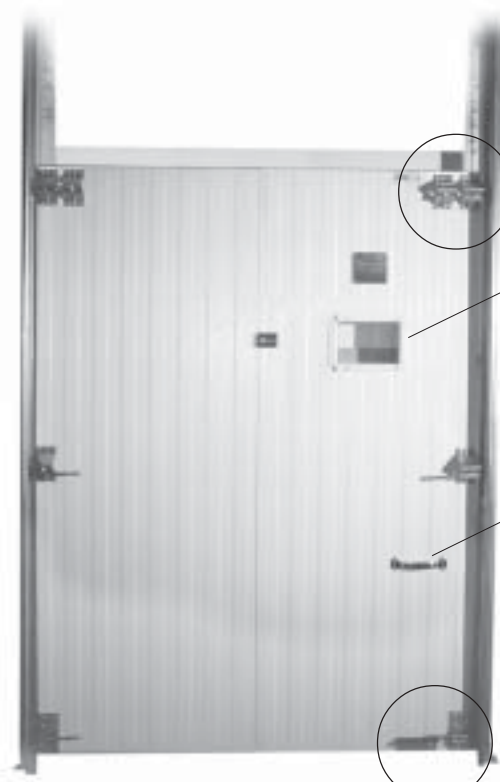
Optional viewing window