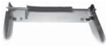
Torsion spring header assembly

Vertical lift doors may be configured in single multi sections. Inside clearances are allowed as required. Depending on traffic requirements doors may be ordered with manual or electric operation.