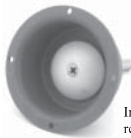
Inside safety release