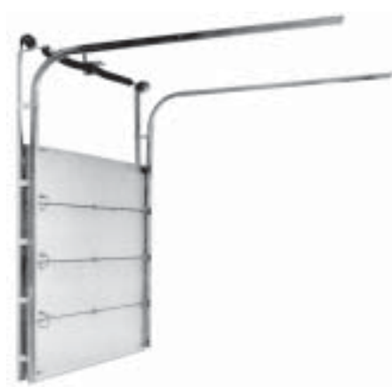
Sectional Panel Type