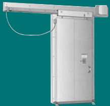
Single Sliding Doors