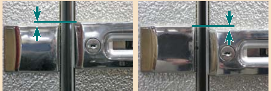
These two photos show the latch alignment changes available by using the adjustable hinge. Adjustments can be made up to 5/16 inch over 360 degrees.

The Imperial adjustable hinge is currently available for Kason 1245 and 1248 hinges. Consult with factory regarding other hardware applications.