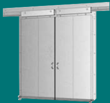
Bi-Parting Sliding Doors