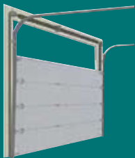
Standard or High Lift Doors